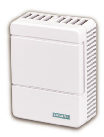
Figure 1. Q-Series Room Relative Humidity and Relative Humidity & Temperature Sensor.