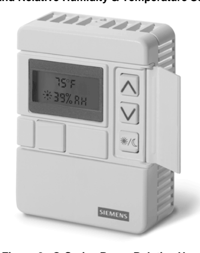
Figure 2. Q-Series Room Relative Humidity and Relative Humidity & Temperature Sensor.