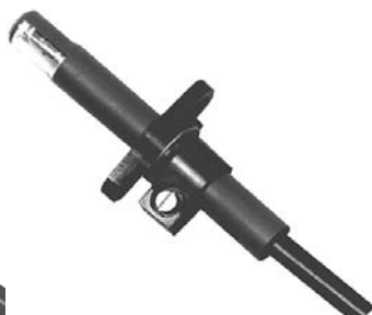
QRB1...A with small flange and clamp