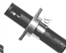
QRB3... with flange and clamp