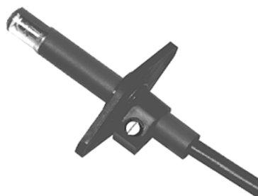
QRB1...A with large flange and clamp