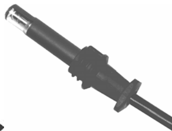
QRB1...B with plug