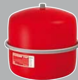
FLEXCON TOP 8 - 25